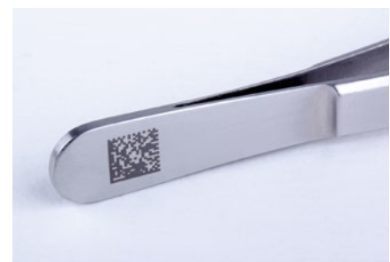
Marking of medical instruments