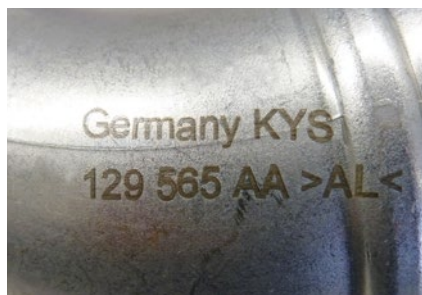
Marking of metal parts