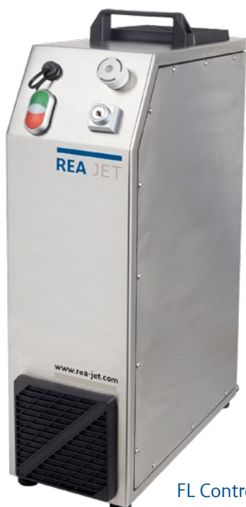
FL Controller Unit