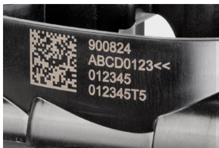
Marking of plastic parts

TITAN The REA JET TITAN Platform. The single operating concept for all REA JET technologies.