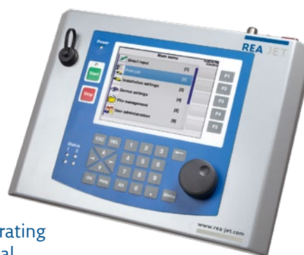
FL Operating Terminal