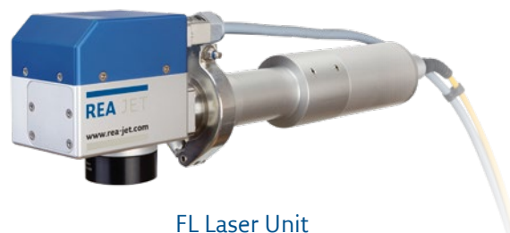
FL Laser Unit