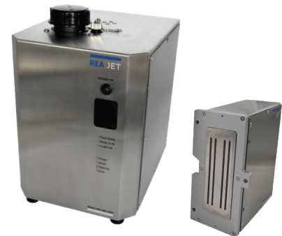
Ink supply unit With print head