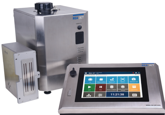
REA JET UP with Touch Controller and ink supply unit

The rugged and at the same time compact device design allows for easy integration into any product line. It also makes it suitable for Industry 4.0, which is a matter of course for REA JET.